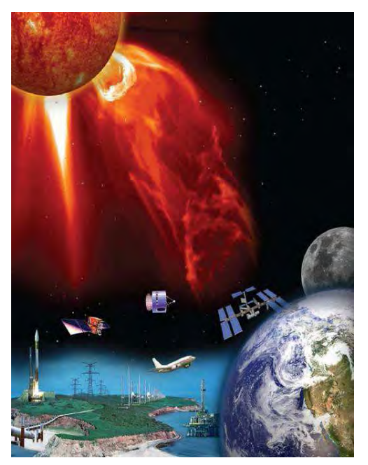
Fig. 1 The impact of solar activity on planet Earth (NASA)