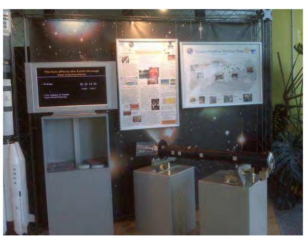
Fig. 2 ISWI displays in the UNOOSA permanent space exhibit at the United Nations Office at Vienna

For many years UNOOSA has maintained the United Nations Permanent Space Exhibit located at the Vienna International Centre. The exhibit is one of the highlights of the public tours conducted by the United Nations Information Services (UNIS) at the United Nations Office at Vienna. Each year