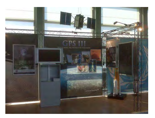
Fig. 6 A model of a GPS Block III satellite in the United Nations Permanent Space Exhibit

Ionospheric modeling using Global Positioning System (GPS) data is the focus of extensive efforts within the GPS community (see Fig. 6). The range error caused by ionospheric delay in GPS signals is currently the largest component that affects the accuracy of positioning and navigation using single frequency determination GPS measurements. Ionospheric modeling is an effective approach for correcting the ionospheric range error and improving the GPS positioning