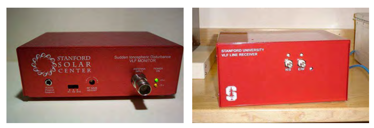
Fig. 3 SID and AWSOME instruments (Stanford Solar Center)

their local high school or university and can thus become part of the worldwide SID or AWESOME instrument array (see Fig. 4).