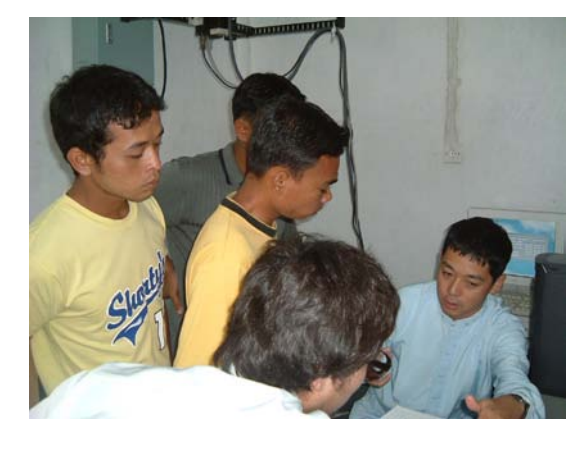
Figure 2. A photo of OMTIs installation at Indonesia.

photometers, and airglow temperature photometers. These instruments obtain two-dimensional images, Doppler winds, and temperatures of the upper atmosphere altitudes of 80-300 km through nocturnal airglow emissions which is invisible weak light emitted from the upper atmosphere. There are several airglow emission layers in the upper atmosphere, for example, emission from oxygen atom at a wavelength of 557.7 nm at 90-100 km, infrared emission from hydroxyl (OH) at 80-90 km, and 630.0-nm emission from oxygen at 200-300 km, as schematically shown in Figure 1. By changing the measurement wavelengths, we observe dynamics of the mesosphere, thermosphere, and ionosphere separately. The upper atmosphere is the region where most of the artificial satellites and space stations exist. of OMTIs Thus the measurements contribute to the space use by human beings through understanding "geospace" environment.