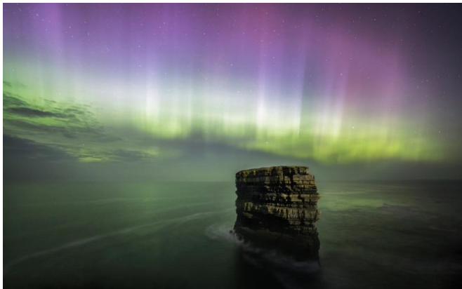
The March 17 geomagnetic storm as seen from Co. Mayo, with the Sea Stack, known as 'Dún Briste', (The Broken Fort) in shot.

Physicists from Trinity College Dublin have developed a space weather warning system to help safeguard electricity and communications systems from solar and geomagnetic storms.