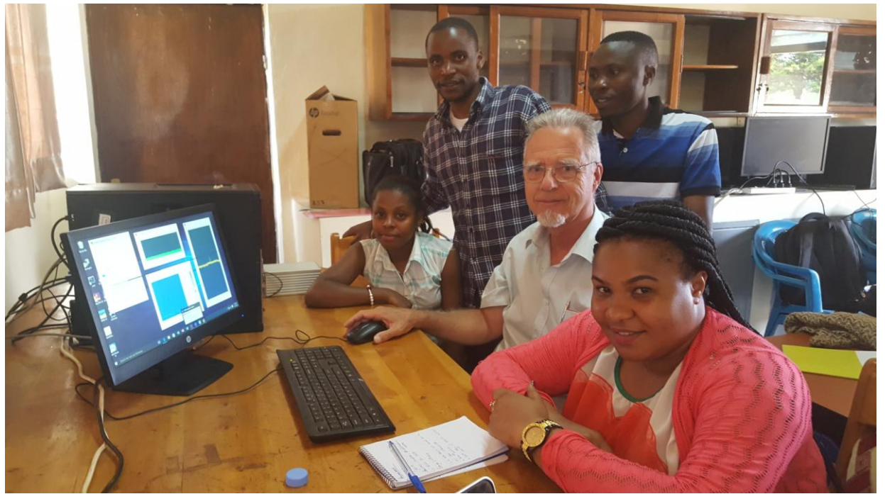
Fig. 2: CALLISTO core team in the CALLISTO laboratory during tests of the instrument.