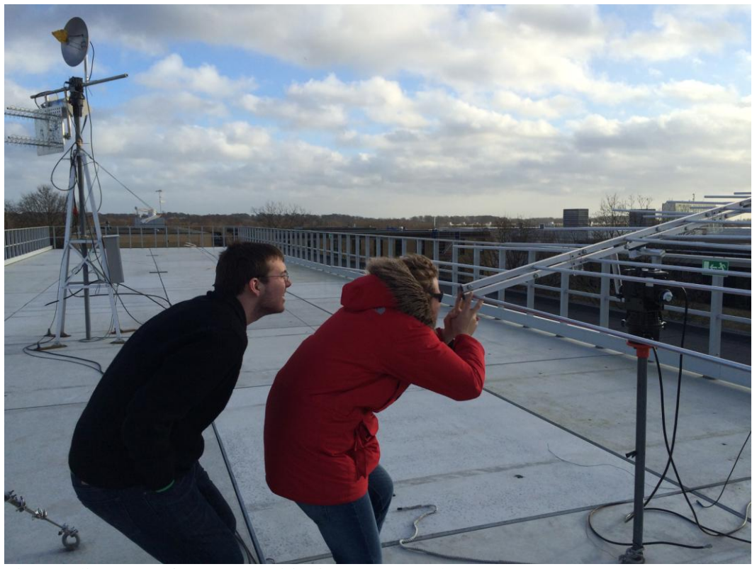
Fig. 1: Alignment of antenna positioning system to the sun.

Through three projects performed by students, Technical University of Denmark is now ready to join the e-Callisto network. The first project was to construct a log periodic dipole antenna (LPDA) and connect it to the Callisto receiver. Another project was to mount the antenna on motor in order to track the Sun automatically. For this an Arduino microprocessor system was used to control the motor. A third project was to stream data both to the e-Callisto server and to our internal use. It now seems that all parts are working and we can supply data from southern Scandinavia. The responsible contact person at Technical University of Denmark is Kristoffer Leer (mail: kleer (at) space.dtu.dk)