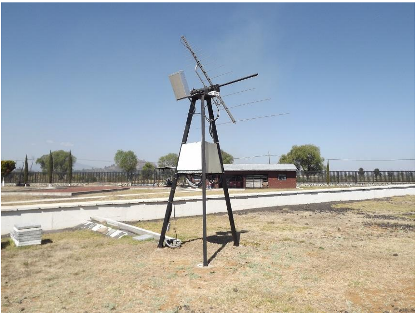
Fig. 2: Antenna with automatic positioning system at UNAM - Instituto de Geofísica unidad Michoacan Servicio de Clima Espacial – Mexico.