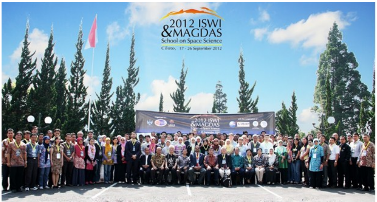
Fig. 1: Participants of the 2012 ISWI and MAGDAS School on space science in Ciloto, Indonesia