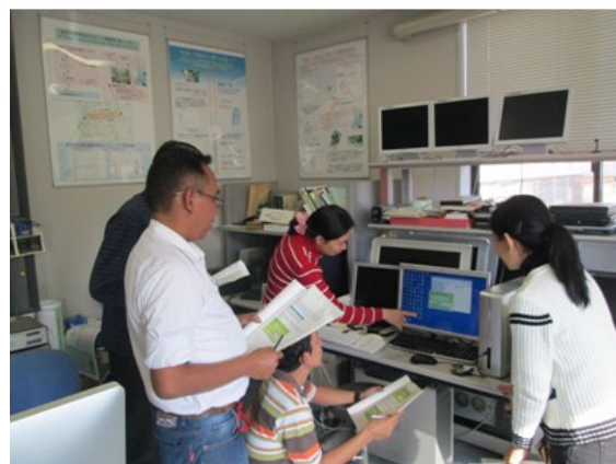
Fig.3. Teaching the MAGDAS training participants how to back up the system card of the magnetometer

These training courses were given with the hope of paving the way towards the progress of space weather science in developing nations.