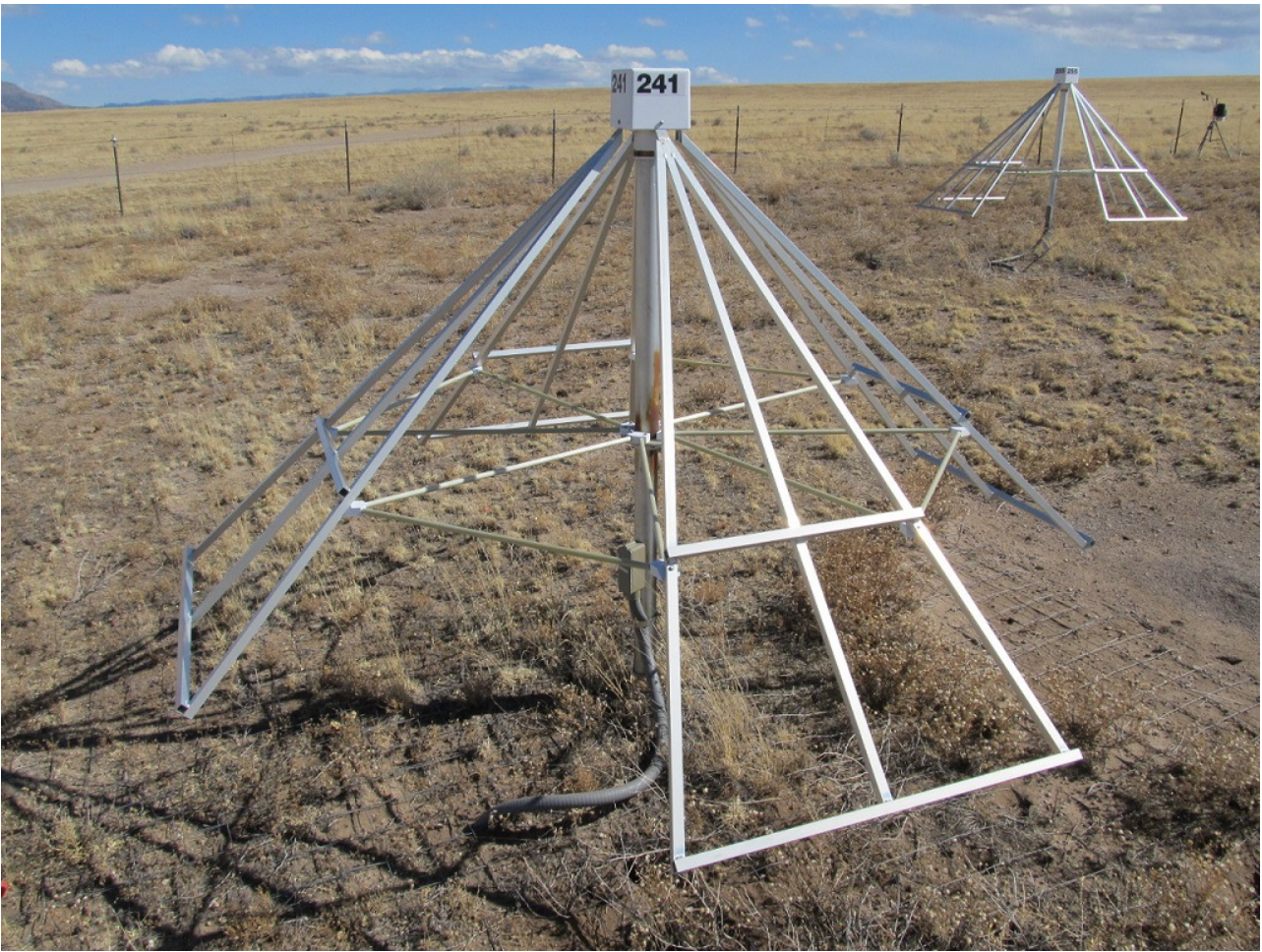
Figure 2: LWA1 antenna in New Mexico.

An article (W. Reeve) about schematics and modeling of the LWA can be found here: <a href="http://www.reeve.com/Documents/Long%20Wavelength%20Array/Reeve">http://www.reeve.com/Documents/Long%20Wavelength%20Array/Reeve</a> LWA-Model.pdf