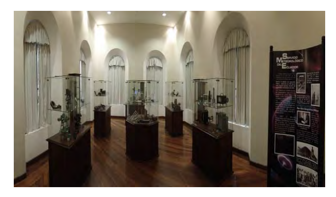
Figure 5: Meteorological instruments of the first station (1891).