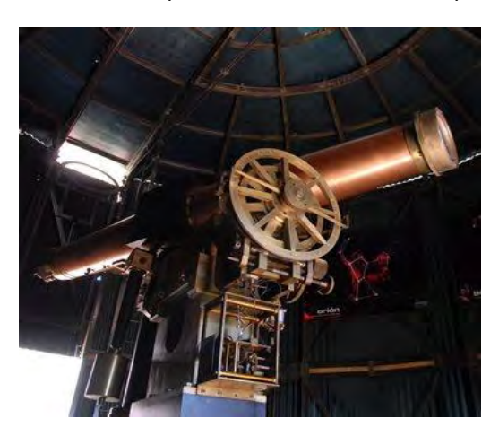
Figure 8: Ecuatorial Merz telescope made in Germany (1875)

On the other hand, in order to involve the community and in particular children and students with the sciences, the Observatory offers several facilities: the first Ecuadorian astronomical museum has been created on the basis of the old instruments and equipment of the Quito Observatory heritage. This new museum located inside of Observatory installations in the Alameda Park in Quito downtown was totally open in the summer of 2012. A large collection of astronomical, meteorological and seismological instruments are in permanent exhibition for the public.