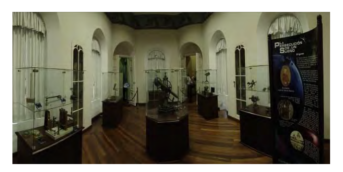
Figure 4: First QAO astronomical instruments installed in 1873.