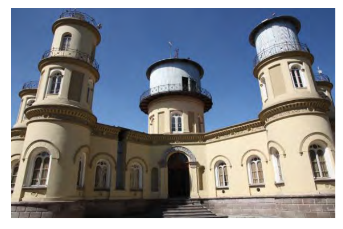
Figure 3: Building of the Quito Astronomical Observatory after the restoration in 2010.

Today, the Quito Observatory, after a hard work, looks magnificent, in great conditions and completely operative. Actually, this is the place, where a nascent active scientific life occurs, where young students, technician and scientists all together have the serious conviction to devote their time and best effort to making of this observatory a serious and solid scientific institution contributing to understanding the physical phenomena of the Universe.