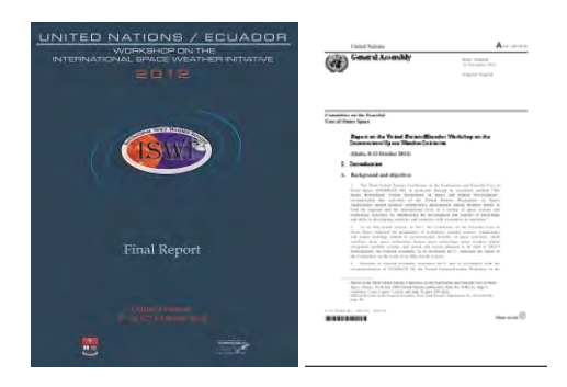
Figure 10: Resolutions of the UN-Ecuador Workshop on the International Space Weather Initiative October 12, 2012, Quito, Ecuador.

outcomes of the Workshop: first, actually Ecuador is measuring the local magnetic field in the Jerusalem place, where the magnetometer of the MADAS array was installed. This was possible thanks to the valuable contribution of the Kyushu University of Japan. The Workshop was essential to consolidate the local support of our authorities for the creation of the new space sciences station in Ecuador, to which future collaborations from the nets: Savnet, Gps network, Callisto will join. On the other hand, possible new space sciences events in Ecuador are in mind for the realization in the next future, as the 2014 space science school on MAGDAS data processing. Beside that new students are interested and involved in space science studies. New contacts and future projects in joint research collaboration have been coordinated during the Workshop. However, from our point of view, a relevant result of the meeting is the fact that space science studies are better understood and appreciated by both the local government and university authorities. This point in turn could facilitate the development of space science studies providing the required financial support. Finally, the regional interest for mutual international cooperation and the trust on Ecuador capability to carry out space science studies have been enhanced.