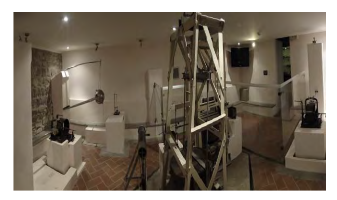
Figure 6: First seismological station in Ecuador (1904), recently restored.

Nowadays, the activities of the Quito astronomical observatory mainly are inside of three large fields: the first one is the scientific research in several areas of Astronomy, Space Sciences and Meteorology. The formal education in astronomy beside the public lectures and talks are in the second place and finally the communication with the public and outreach activities. In the following subsections we will describe in more detail these activities.