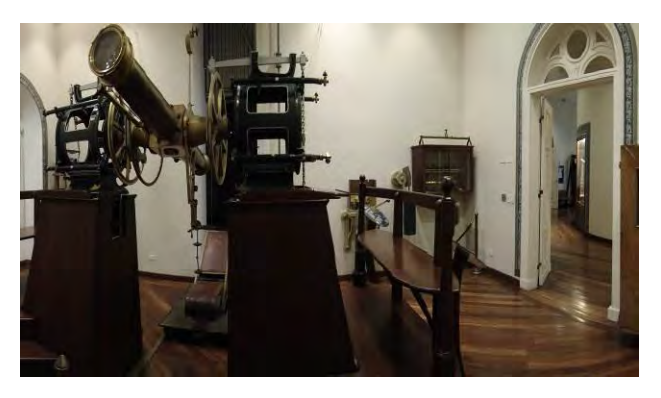
Figure 7: The Observatory Great Meridian Circle (1889)

Nowadays, the activities of the Quito astronomical observatory mainly are inside of three large fields: the first one is the scientific research in several areas of Astronomy, Space Sciences and Meteorology. The formal education in astronomy beside the public lectures and talks are in the second place and finally the communication with the public and outreach activities. In the following subsections we will describe in more detail these activities.