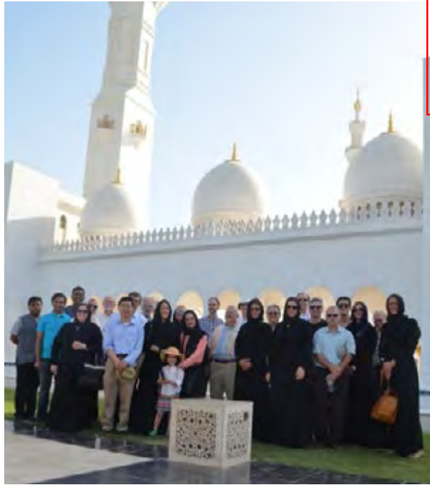
Photo of the participants at the Sheikh Zayed Grand Mosque in Abu Dhabi.

As the organizers noted, the History of Science, Technology, and Medicine (HSTM) field, since its inception, has been dominated by studies written in a national, colonial, or area-studies frame. This remains the case today, although recent scholarship has increasingly drawn attention to the significance of global transmission and exchanges of technical knowledge, materials, and experts in shaping the process of scientific, technological, and medical change in regions around the world. Yet, as historians have moved towards writing