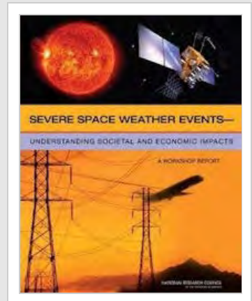
NASA-funded study by the Α National Academy of Sciences lays out the economic consequences of severe space weather. More

"The new permanent agenda item of the Science and Technology Subcommittee is an important opportunity to