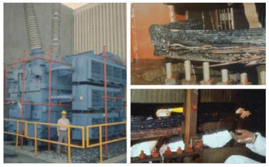
Permanent damage to the Salem New Jersey Nuclear Plant GSU Transformer caused by the severe geomagnetic storm of March 13, 1989. More

"Space weather is a significant natural hazard that requires global preparedness," says Prof. Hans Haubold of the UN Office for Outer Space Affairs. "This new agenda item links space science and space technology for the benefit of all humankind."