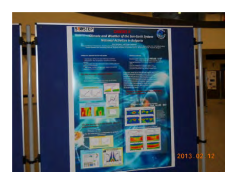
Photo 3: The poster featuring the SCOSTEP/CAWSES activities in Bulgaria