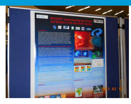
Photo 2: SCOSTEP's poster at the ILWS 10<sup>th</sup> anniversary symposium

(<u>http://ilwsonline.org/tenthanniversary/</u>). All posters can be found on the SCOSTEP website.