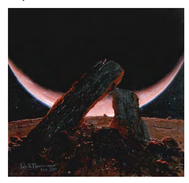
Room Three: This painting, which portrays impact-ejected boulders stacked in the low-gravity environment of Phobos, sold during the show.