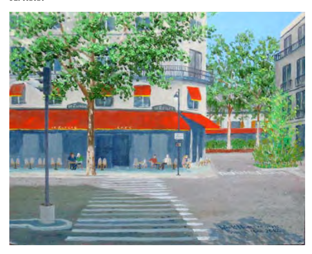
Room Two: A typical Paris cafe on Blvd. St. Michel, painted in Paris on the way to a scientific meeting elsewhere in Europe.