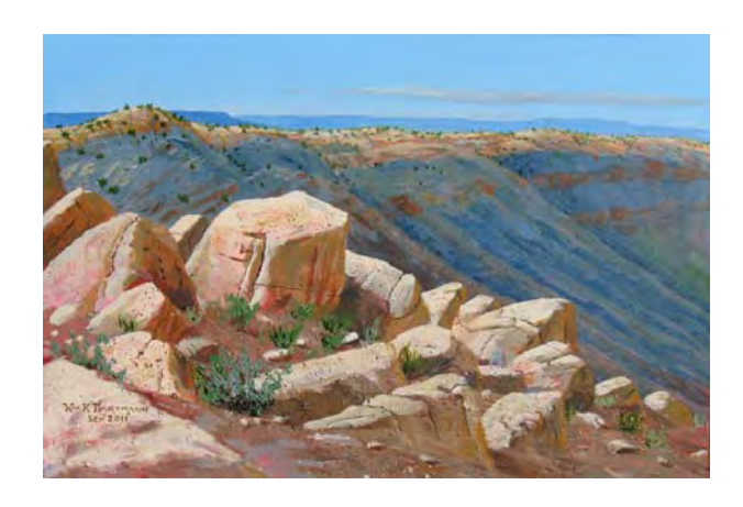
Displayed in Room One at the exhibition: On the rim of Arizona's "Meteor Crater," showing boulders ejected during the impact. The painting was made on site during a workshop of the International Association of Astronomical Artists.