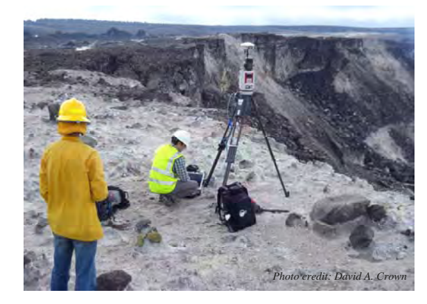
Laser scanner system set up at the rim of Halema'uma'u Crater for topographic survey of the active summit vent.