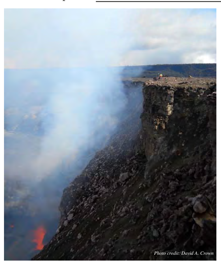
This overlook at Kīlauea Volcano was open to tourists until 2008 when the current eruptive activity at Kīlauea's summit began. The intense heat, as well as sulfur dioxide gases released from the lava lake below, can be felt at the overlook about 300 ft above.