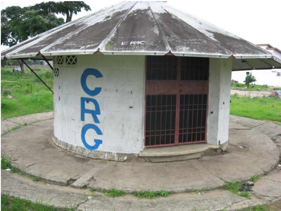
Fig1.: Outside view of Binza magnetic vault entrance.

Data from 1956 through 1980 are partially available.