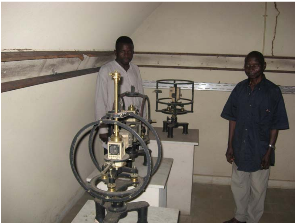
Fig2: Inside view of Binza magnetic vault: stairing down to the vault (up); inside the variometers room(down).