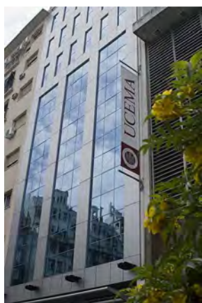
UCEMA building of Reconquista 775, located in downtown Buenos Aires, at the heart of the financial and cultural activity of the country