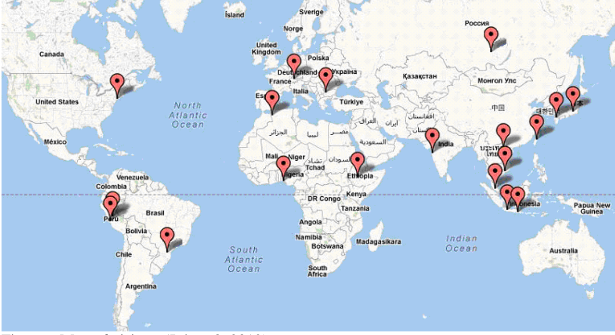
Figure 6 Map of visitors (July 6-8, 2012).