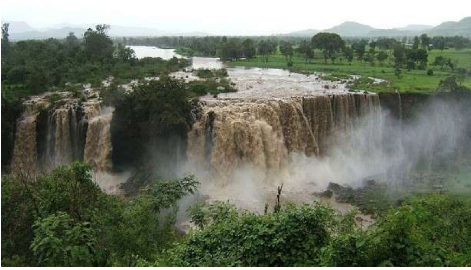
Blue Nile Falls