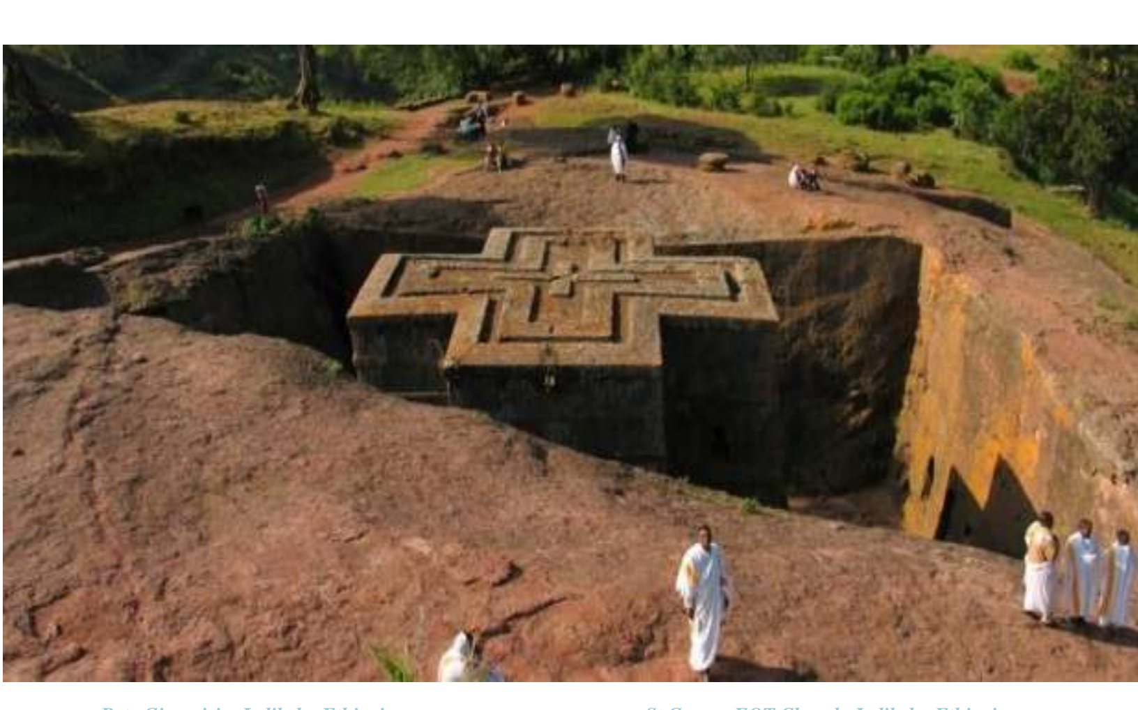
Bete Giyorgisin, Lalibela, Ethiopia