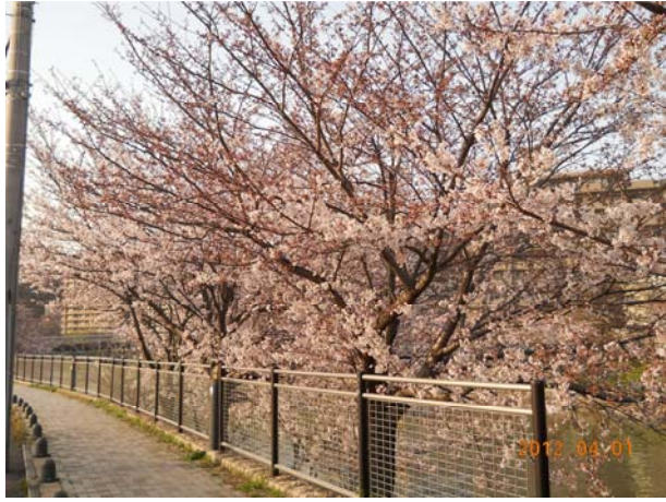
Scenes of Fukuoka. Late afternoon of 1st Apr 2012.