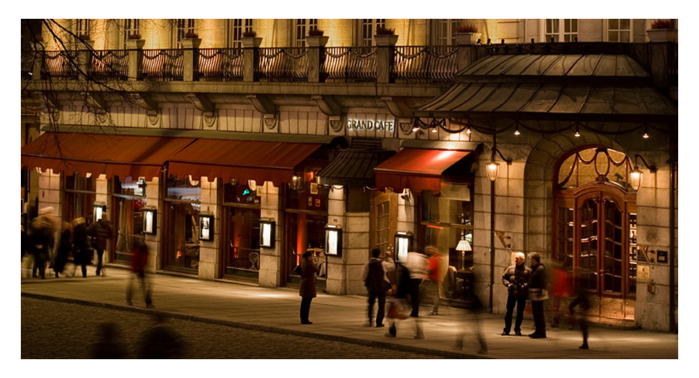
(Availability and Special Rates available until 21st July 2012)