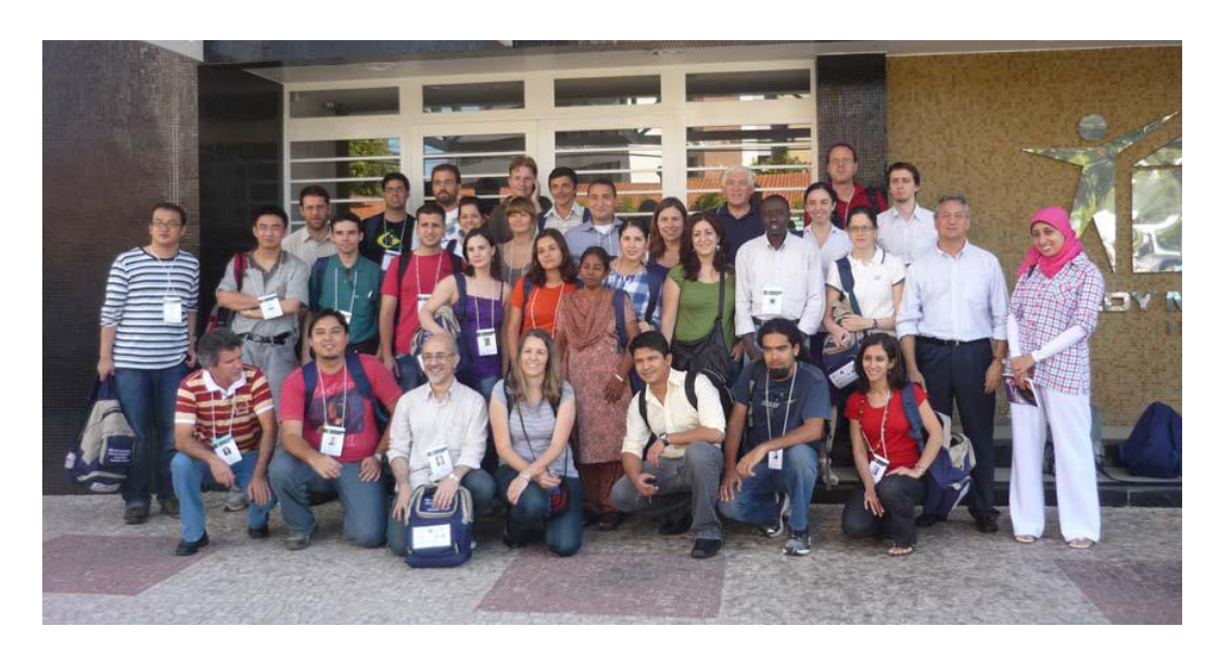
Students and lecturers pose during Capacity Building Course on the Water Cycle, at Fortaleza, November 2010.

relationships between students and the experienced lecturers who led the Course.