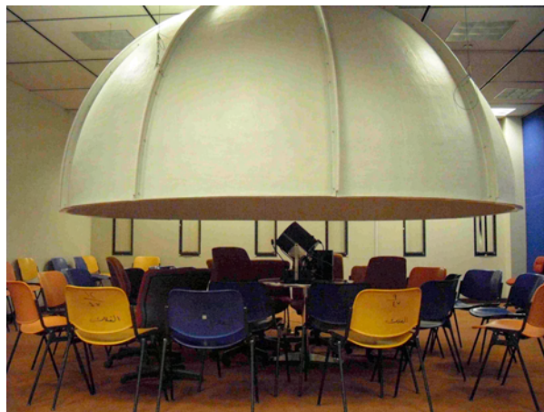
Figure 4 The mini sky-show planetarium

Planetarium: The mini sky-show planetarium at the Astronomy Unit (Figure 4) offers an enjoyable sky illustration for celestial navigation. The planetarium has the form of a hemisphere and can accommodate about 20-25 visitors at time. Amateur astronomers, school students and the general public can follow an exciting and funny 20 minutes exhibition about the secrets of space, identifying the movement of most popular stars and constellations.