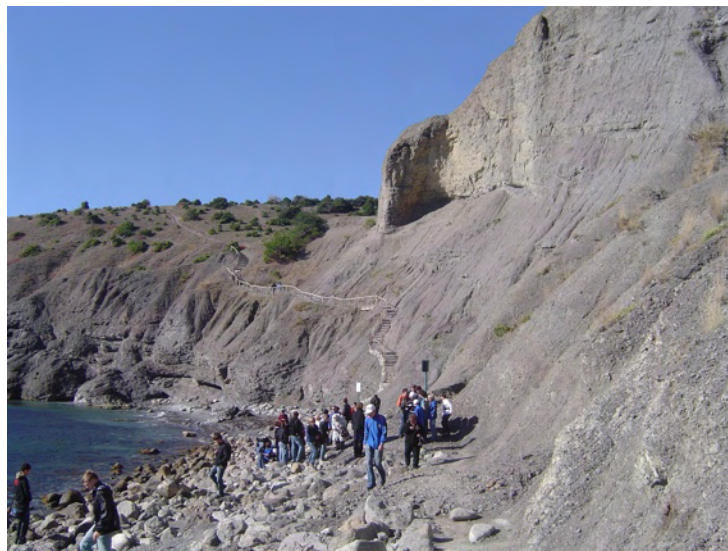
Figure 3 An excursion to Novy Svet bay

Just before the final day of the Olympiad, participants visited a beautiful reserved place in Crimea – Novy Svet (Figure 3). In this place the famous Crimean champagne is produced.