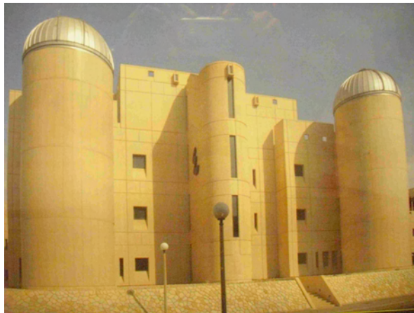
Figure 1 The telescope domes' location at KSU

The Astronomical Observatory at King Saud University (KSU), originally established and inaugurated at Al Malaz in 1976 by prince Salman bin Abd Alaziz, is considered one of the earliest modern observatories in the Arabian Gulf. Since its move to Al Dareyah KSU main campus, the telescopes (domes) have been installed on the roof of the College of Science (Figure 1).