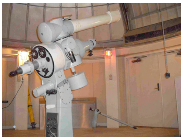
Figure 2 The 15 cm, F/15 Zeiss telescope (operational)

The Observatory consists of two telescopes, a 15 cm F/15 Zeiss telescope (currently operating; Figure 2) and a 45 cm double telescope with a 16/24 cm Schmidt Camera (currently non-operating; Figure 3). A portable small optical telescope is also available for outside monitoring. Additionally, the observatory equipment includes an iris photometer, spectrograph, binoculars, Solar Laboratory and a high accuracy cesium atomic clock that transmits time signals to several electronic panel-clocks located in the University departments and in some government institutions within a range of 5 km.