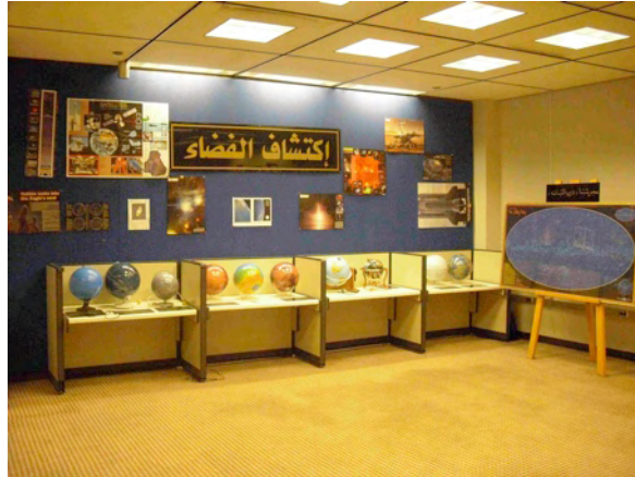
Figure 5 One side of the astronomical museum room