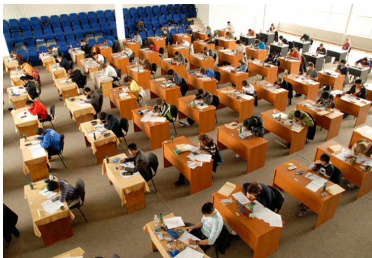
Figure 2 The theoretical round

After that, the evening of acquaintance was held. During that event all the teams represented their own participants and countries of origin. Next day was the first round of the Olympiad – the theoretical round (Figure 2).