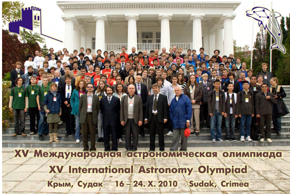
Figure 1 The opening ceremony

On 17 October the opening ceremony of the Olympiad took place (Figure 1).