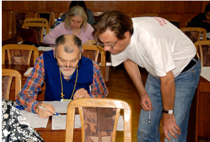
Figure 4 Jury work

As is usual at these meetings, the jury board decided to establish the levels for the 1 st Diploma, 2 nd Diploma, 3 rd Diploma (corresponding to the Gold, Silver and Bronze Medals), as well as the Diploma of Participation.