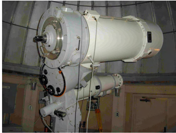
Figure 3 The 45 cm double telescope (non-operational)