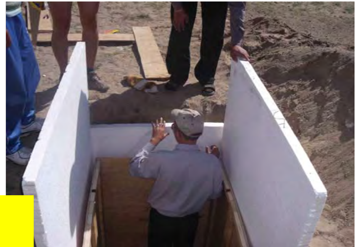
Construction of sensor house (floor is 1.5m below surface).