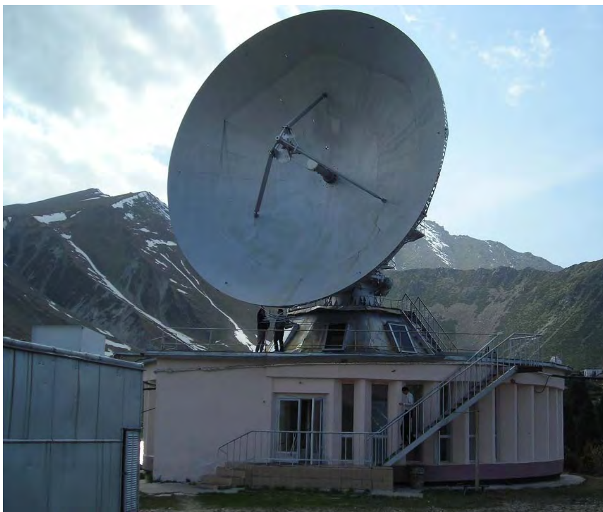
Fig. 1: Home made log-per attached to the lower rim of the 12m-dish. After the log-per antenna there is a low noise preamplifier KUHNE 0515B installed. Callisto, control – PC and power supplies are located in the observatory underneath the antenna.

The main Institute of Ionosphere is located on a natural hill above Almaty, while the Tian Shan observatory, see fig. 1 is in a very remote area in Tian Shan mountains about 30 km south of Almaty. Nowadays the measurements of the solar radio flux at frequencies of 1.078 GHz and 2.8 GHz (10.7 cm) are carried out on the regular basis. The observatory is equipped with optical telescopes and an optical interferometer SATI for recording the emission of night sky in the region of the mesopause. Coordinates of the observatory are 43° 03' North, 76° 58' East, Height is 2740 m above sea level; Local Time is GMT + 05h.